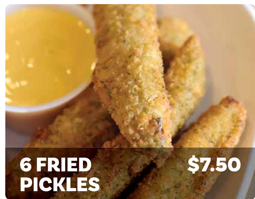
6 FRIED PICKLES $7.50