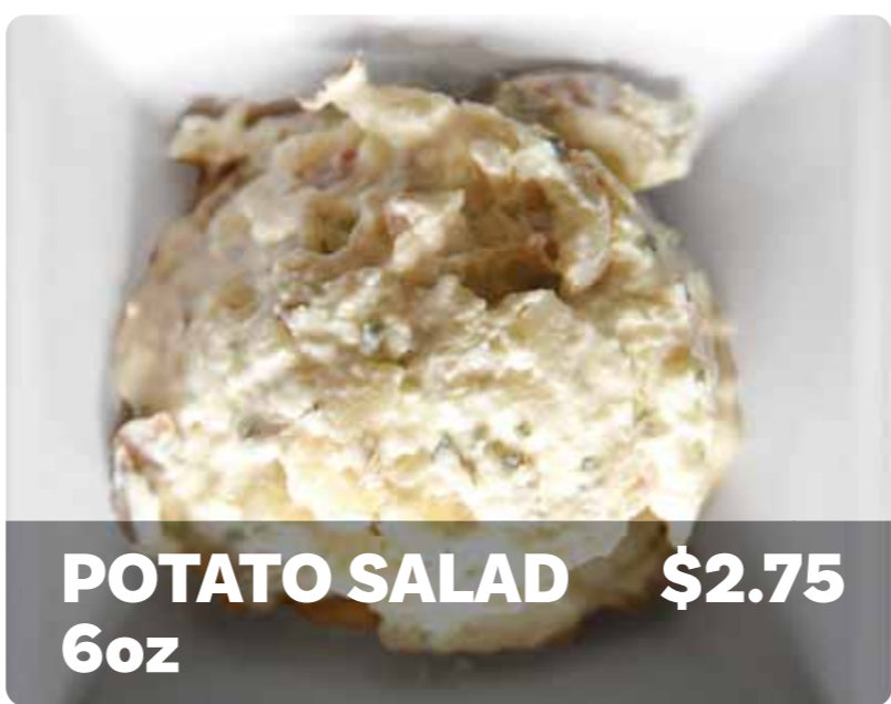
POTATO SALAD $2.75 6oz