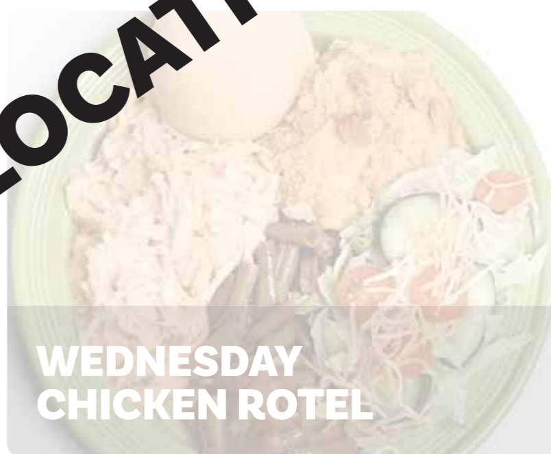
WEDNESDAY CHICKEN ROTEL