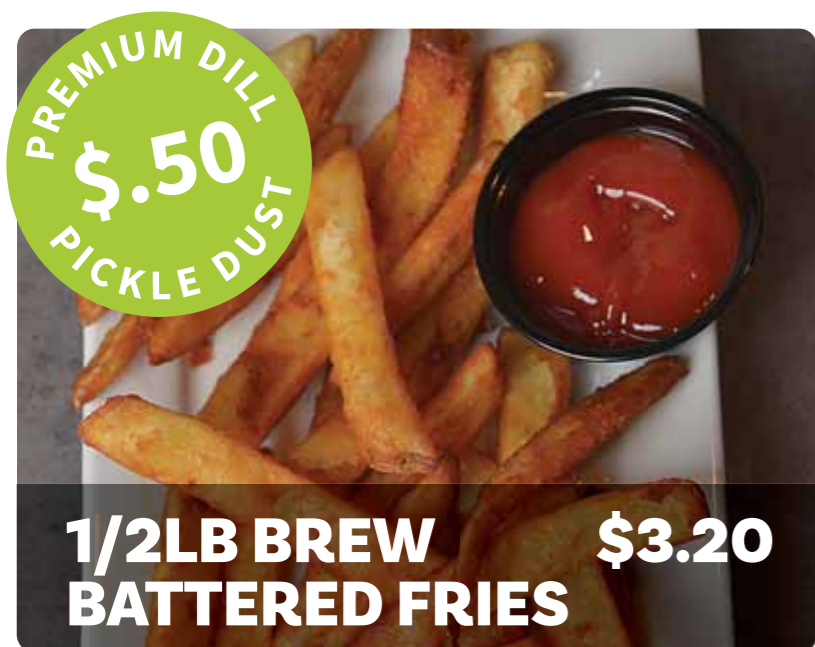
1/2LB BREW BATTERED FRIES $3.20