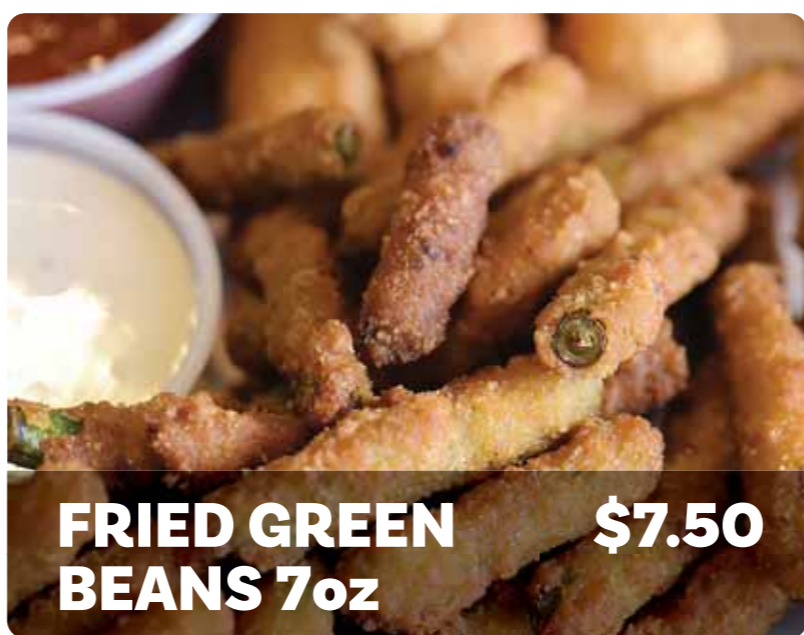
FRIED GREEN $7.50 BEANS 7oz