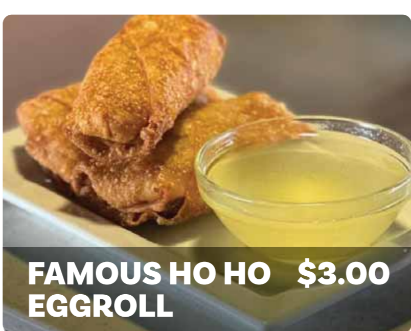
FAMOUS HO HO $3.00 EGGROLL