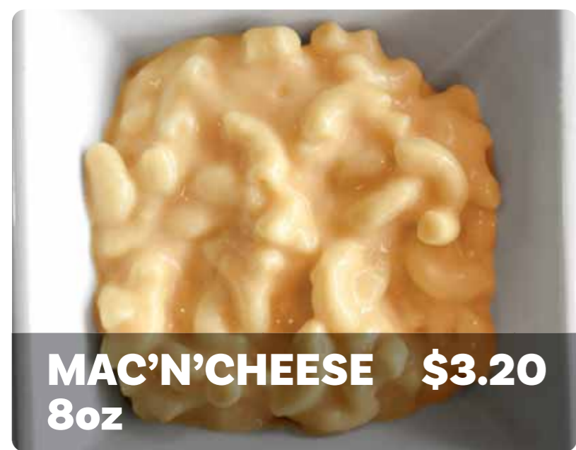
MAC'N'CHEESE $3.20 8oz