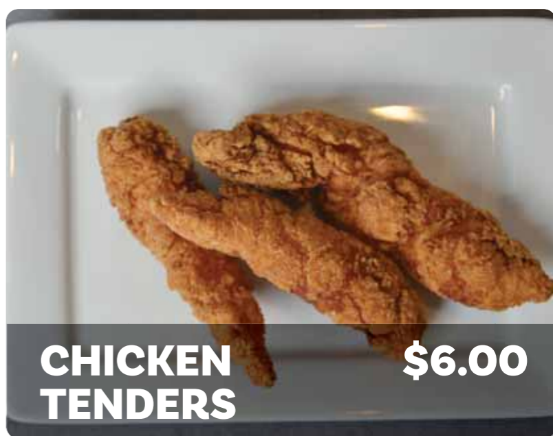
CHICKEN $6.00 TENDERS