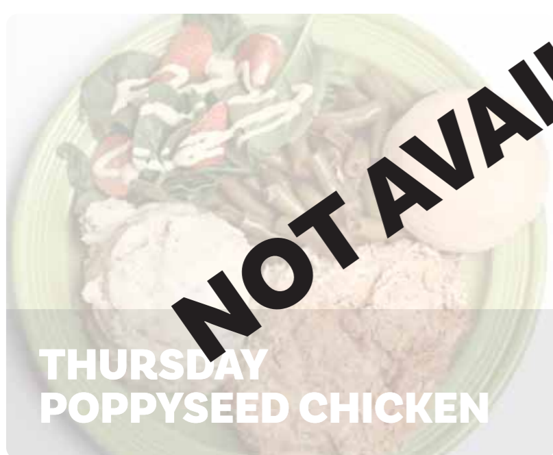
THURSDAY POPPYSEED CHICKEN