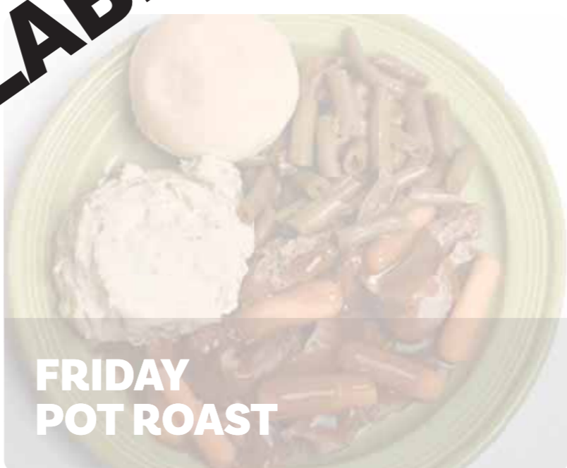
FRIDAY POT ROAST