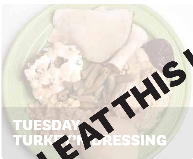
TUESDAY TURKEY DRESSING