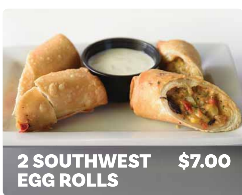
2 SOUTHWEST $7.00 EGG ROLLS