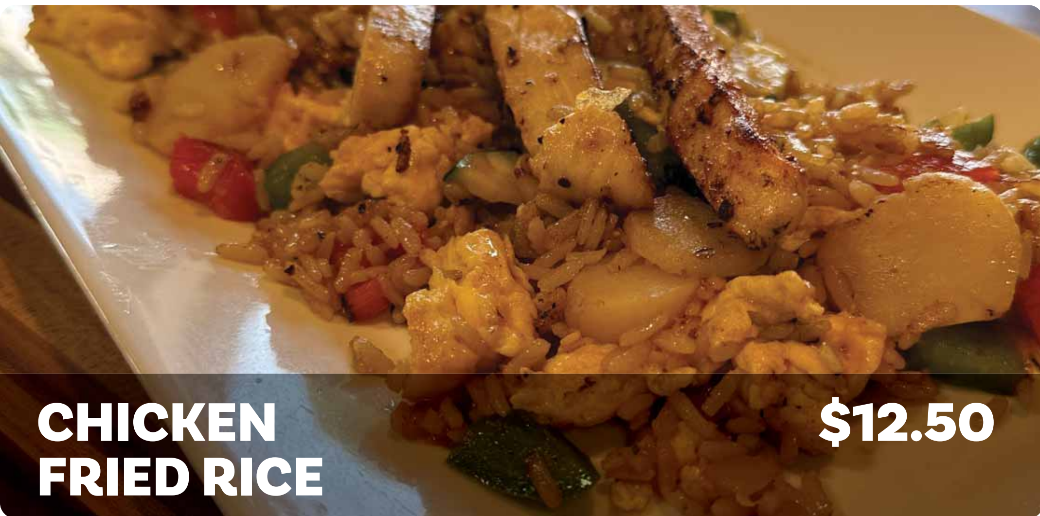
CHICKEN FRIED RICE $12.50

MEAT: CHICKEN, PORK OR STEAK ....add 3.00 ADDS: TOMATO, LETTUCE, BLACK BEANS, ONIONS, ROASTED CORN, MUSHROOMS, CHEESE, JALAPENOS, RED PEPPERS SAUCE: SALSA, SOUR CREAM GUACAMOLE ..... add 1.00