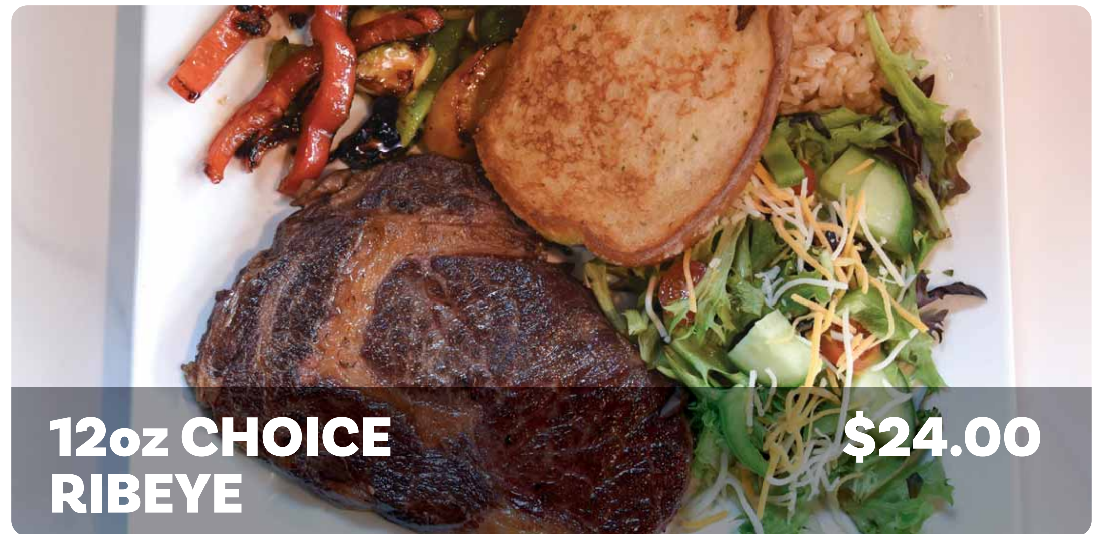
12oz CHOICE RIBEYE $24.00