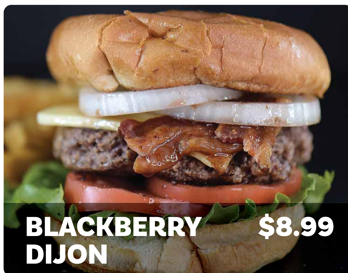
BLACKBERRY DIJON $8.99