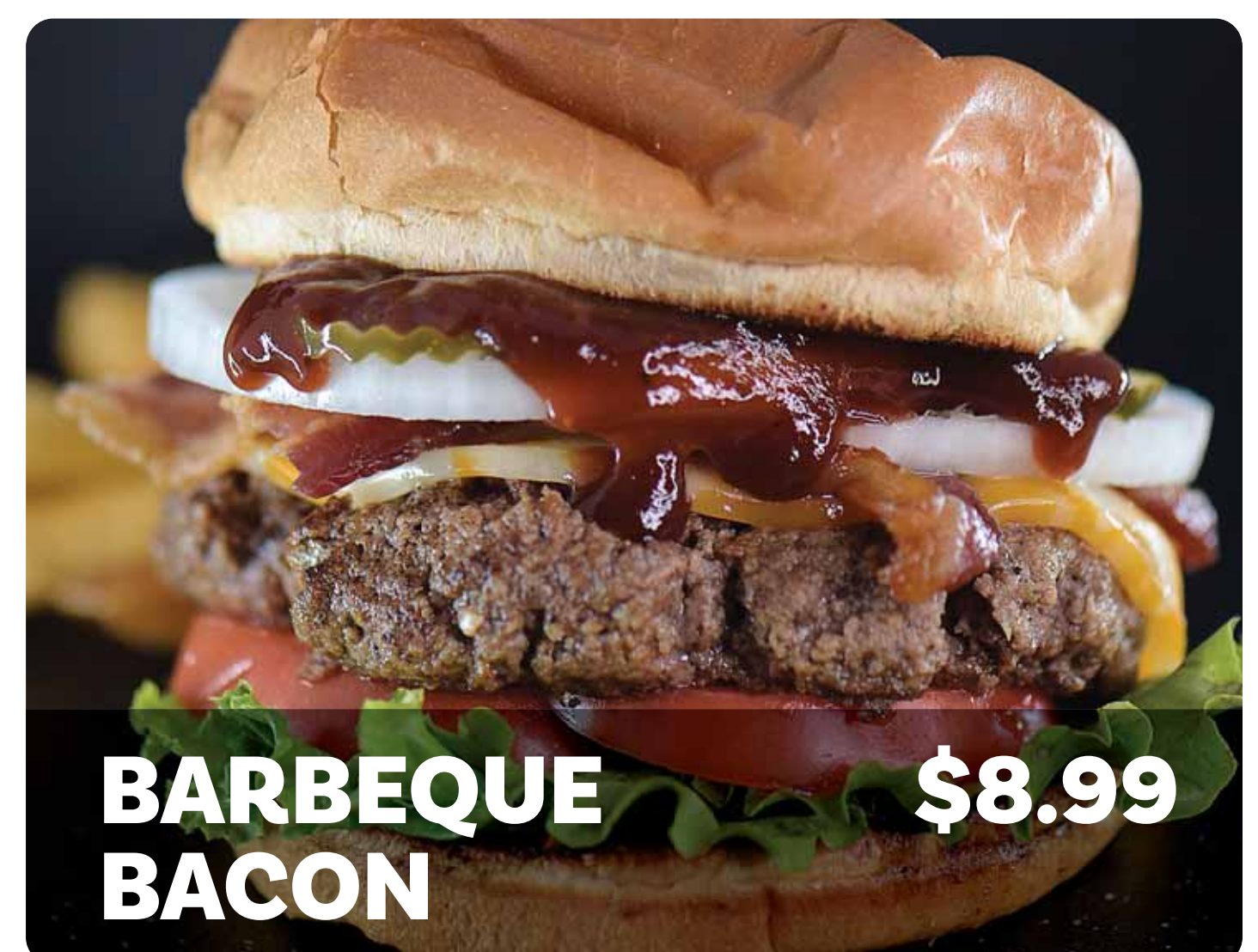
BARBEQUE BACON $8.99