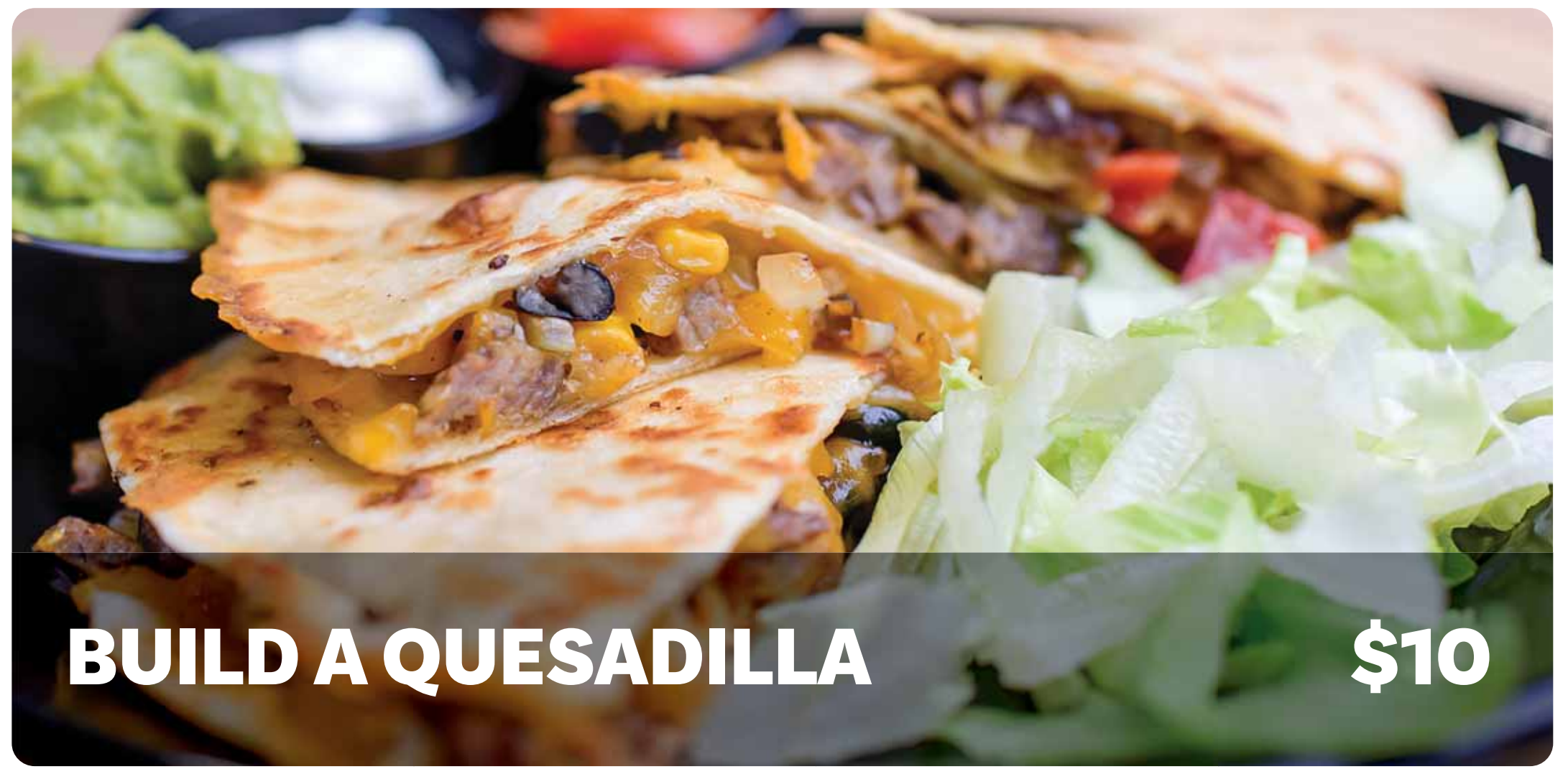
BUILD A QUESADILLA $10

MEAT: CHICKEN, PORK OR STEAK ....add 3.00 RICE: WHITE RICE OR CAULIFLOWER RICE VEGGIES: ZUCCHINI, BROCCOLI, ONIONS, CAULIFLOWER, RED PEPPERS, MUSHROOMS, JALAPENOS, YELLOW SQUASH, CARROTS SAUCE: KOREAN BBQ, BLACKBERRY DIJON, SPICY HONEY, YUM YUM, THAI