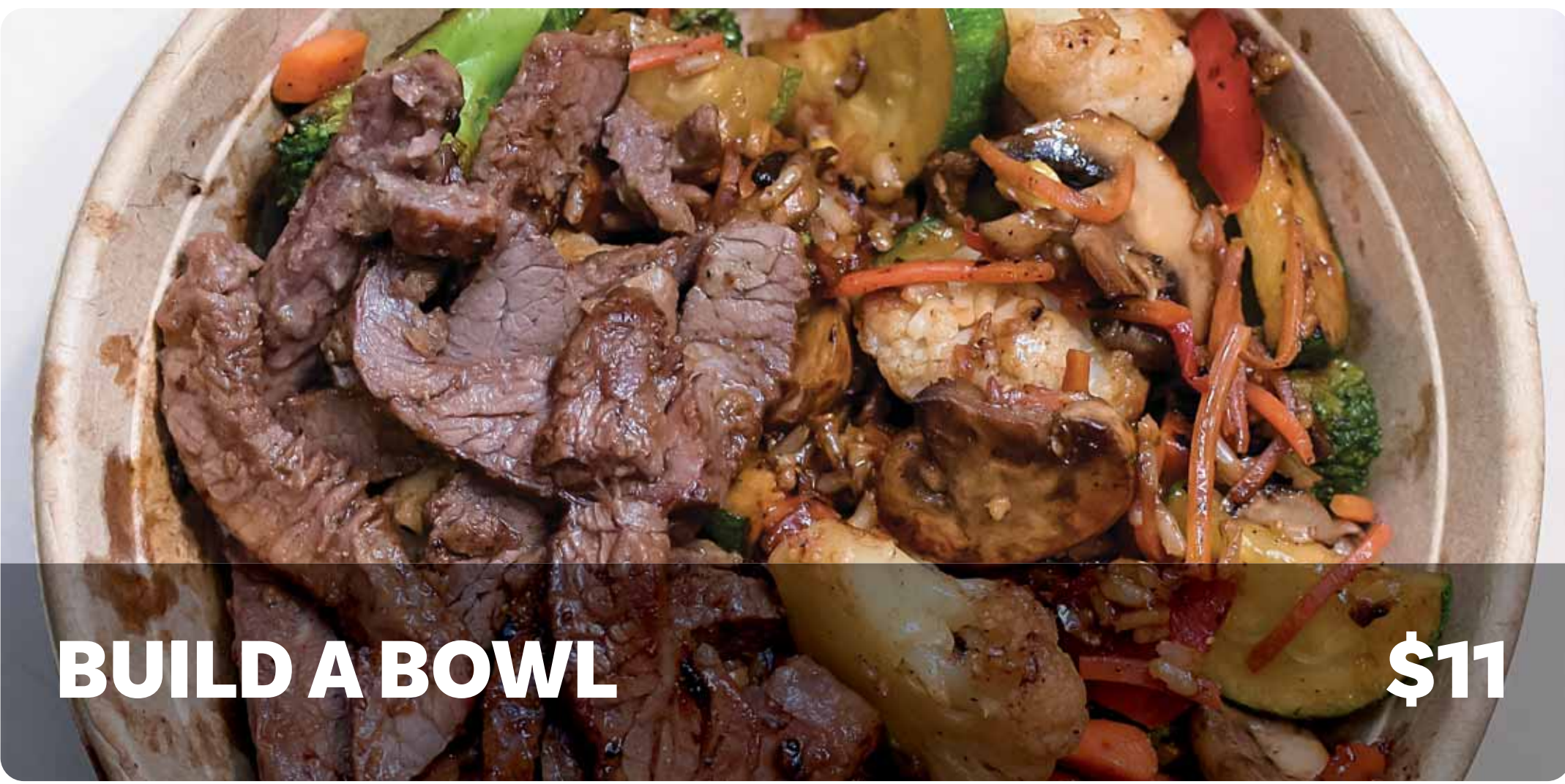
BUILD A BOWL $11

MEAT: CHICKEN, PORK OR STEAK ....add 3.00 RICE: WHITE RICE OR CAULIFLOWER RICE VEGGIES: ZUCCHINI, BROCCOLI, ONIONS, CAULIFLOWER, RED PEPPERS, MUSHROOMS, JALAPENOS, YELLOW SQUASH, CARROTS SAUCE: KOREAN BBQ, BLACKBERRY DIJON, SPICY HONEY, YUM YUM, THAI