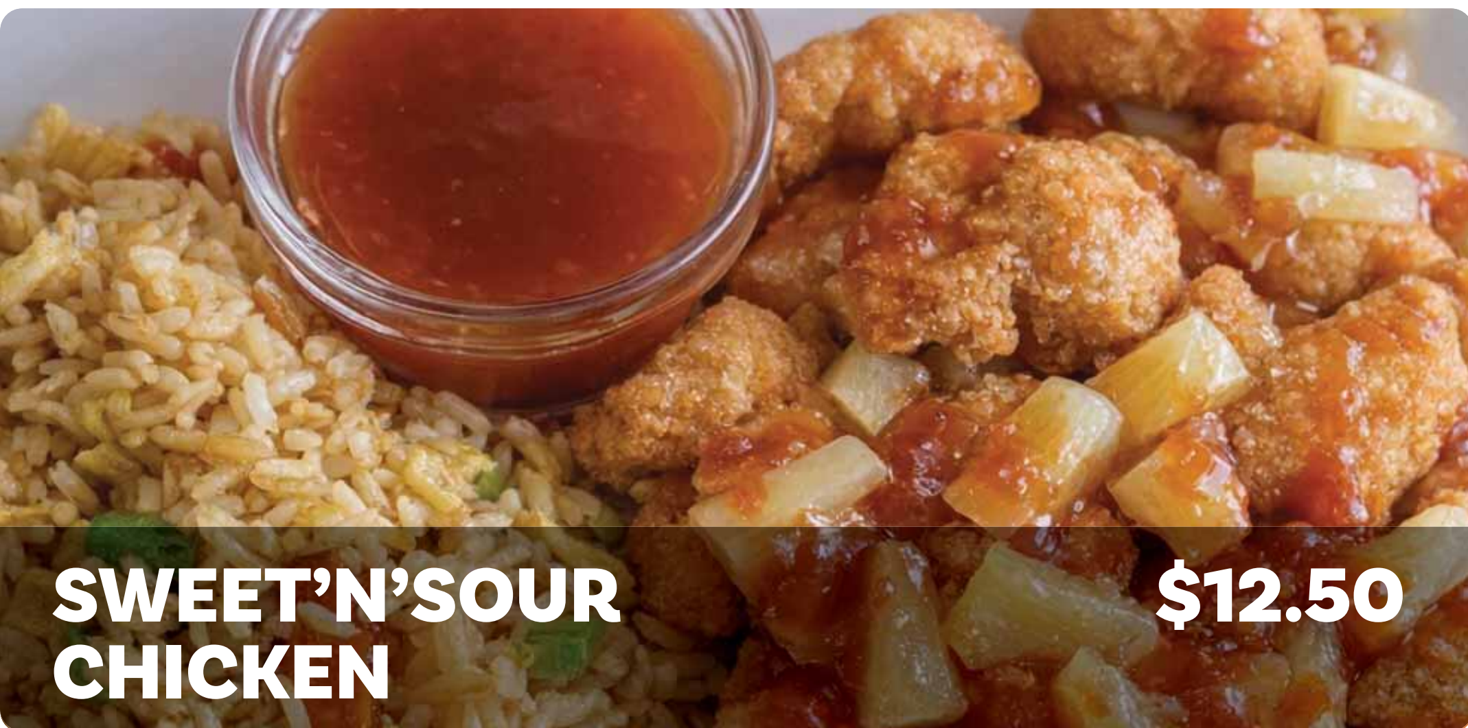
SWEET'N'SOUR CHICKEN $12.50