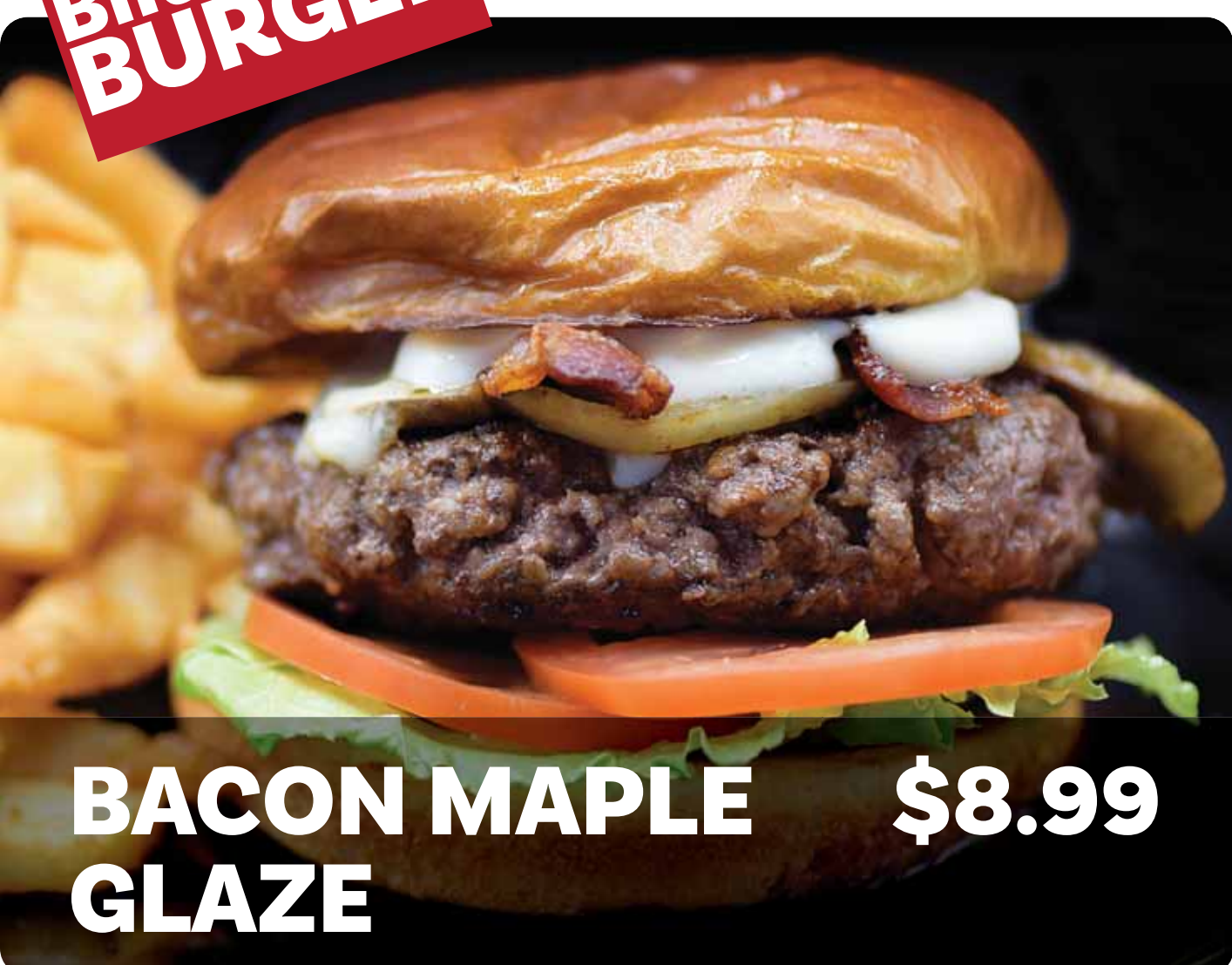
BACON MAPLE GLAZE $8.99