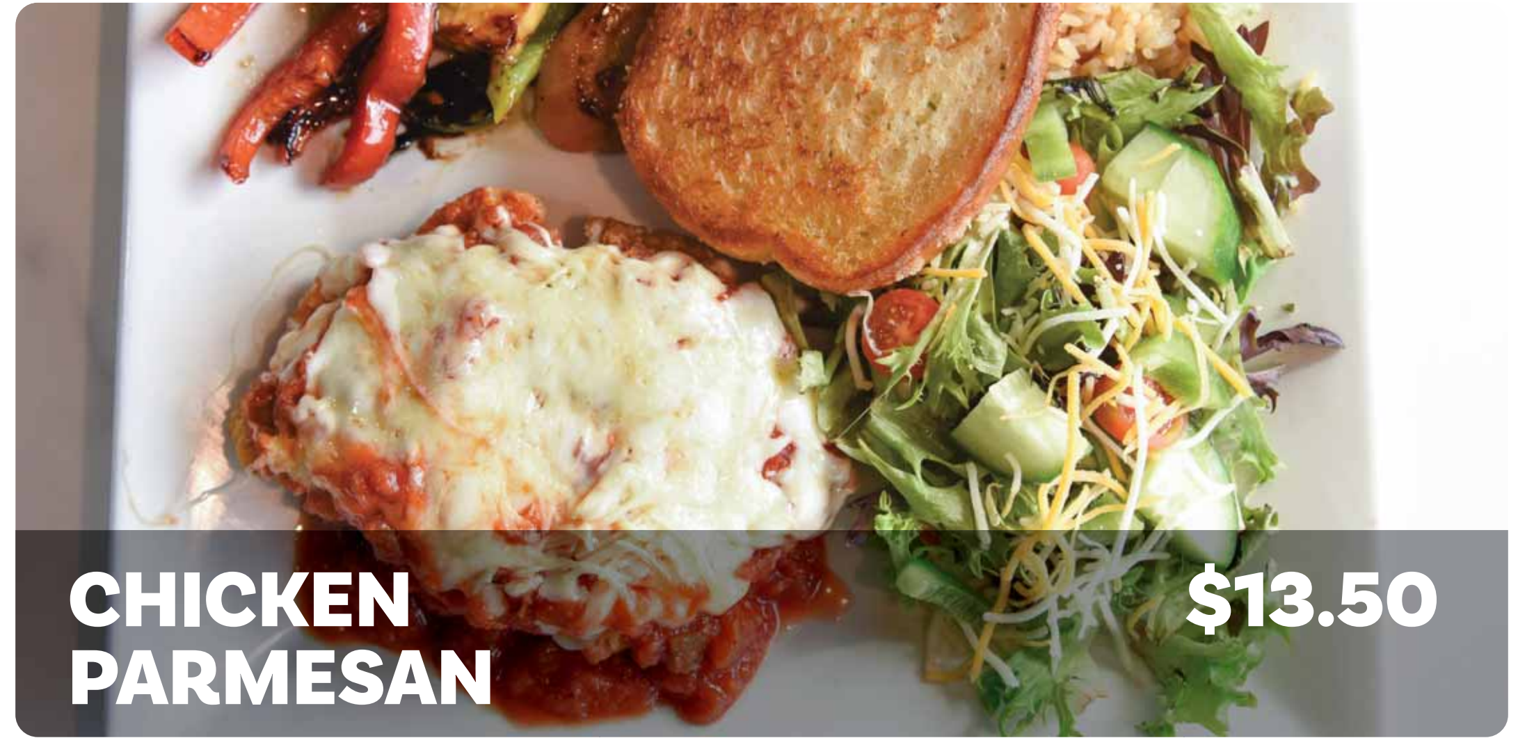
CHICKEN PARMESAN $13.50