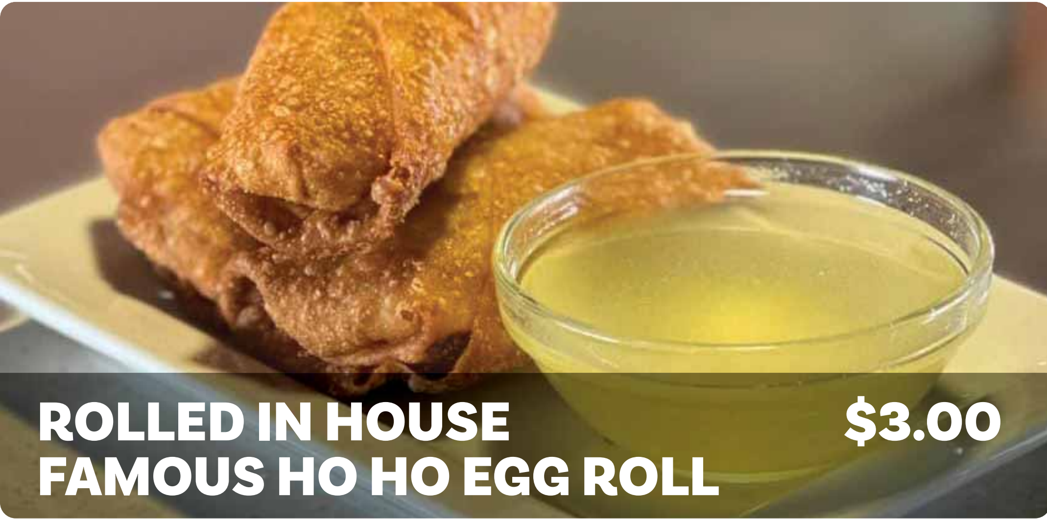
ROLLED IN HOUSE FAMOUS HO HO EGG ROLL $3.00