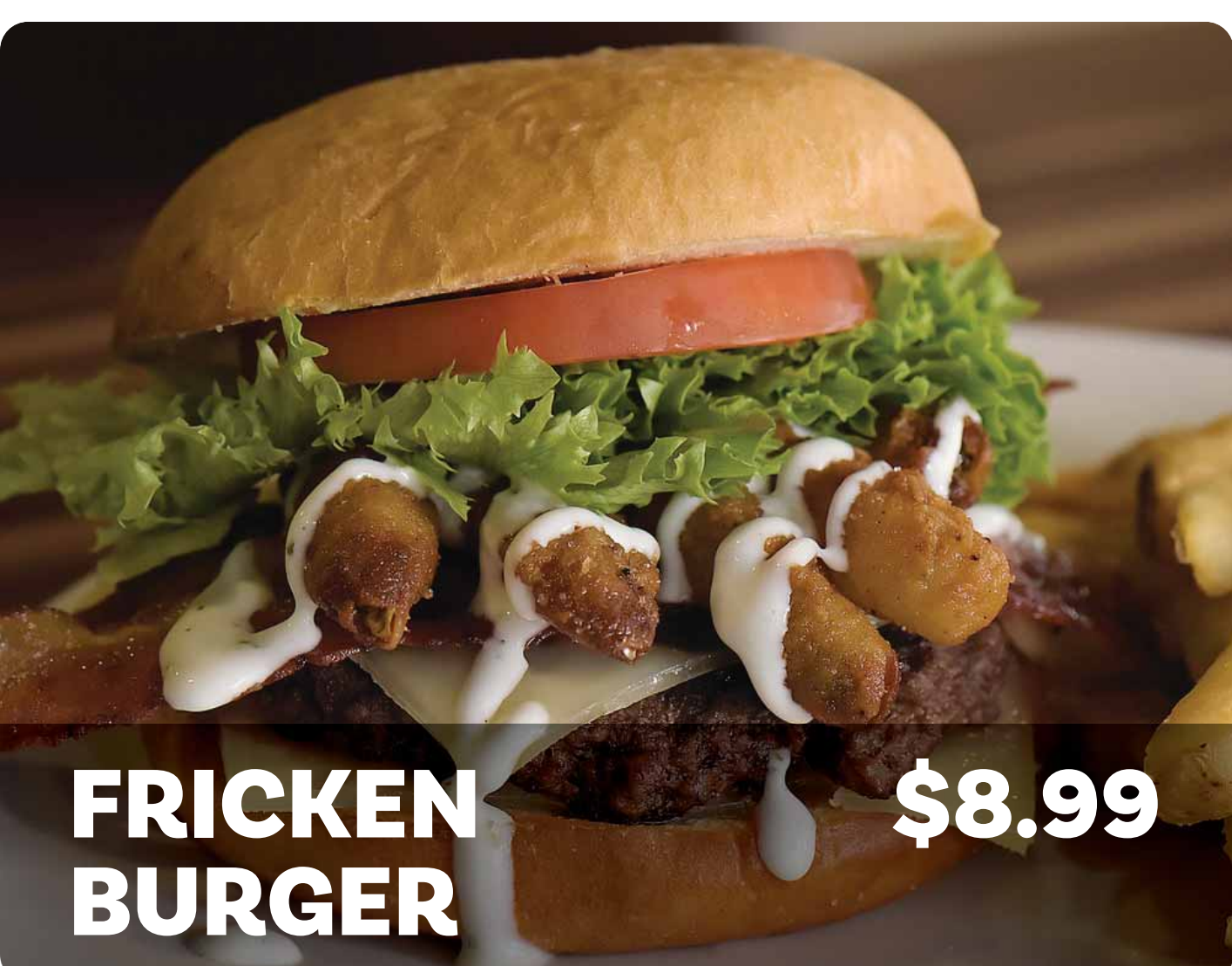
FRICKEN BURGER $8.99