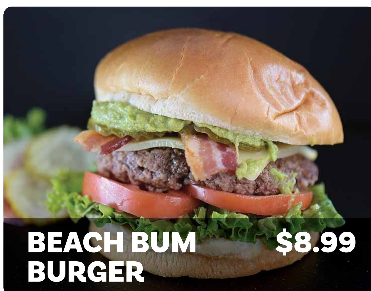
BEACH BUM BURGER $8.99