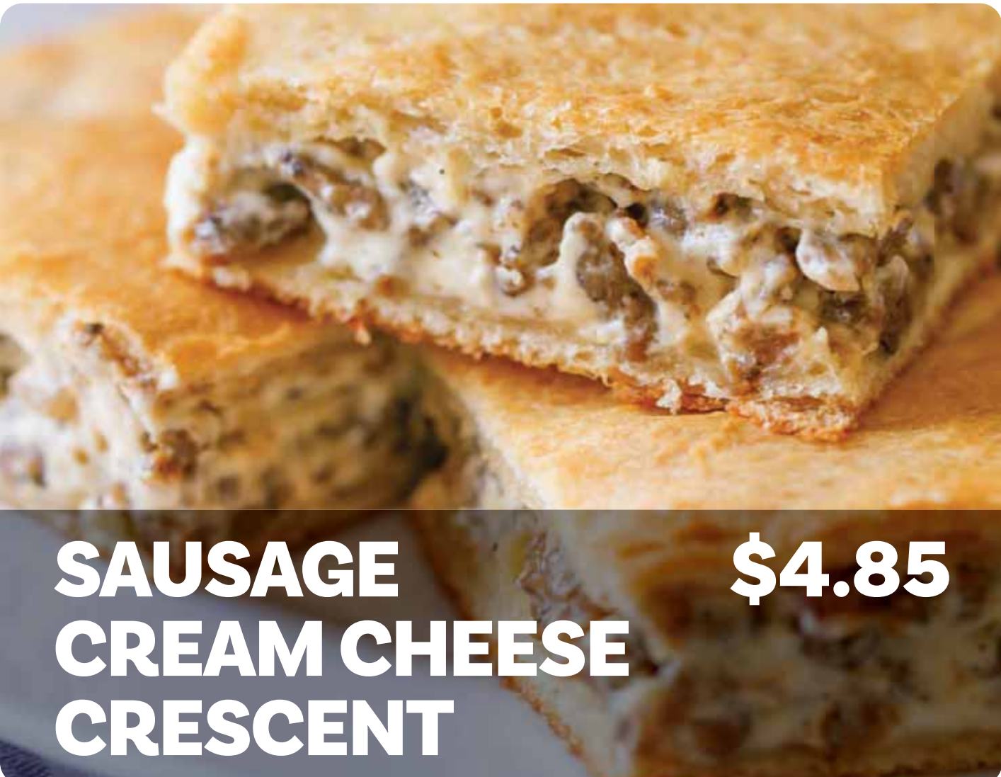
SAUSAGE CREAM CHEESE CRESCENT $4.85