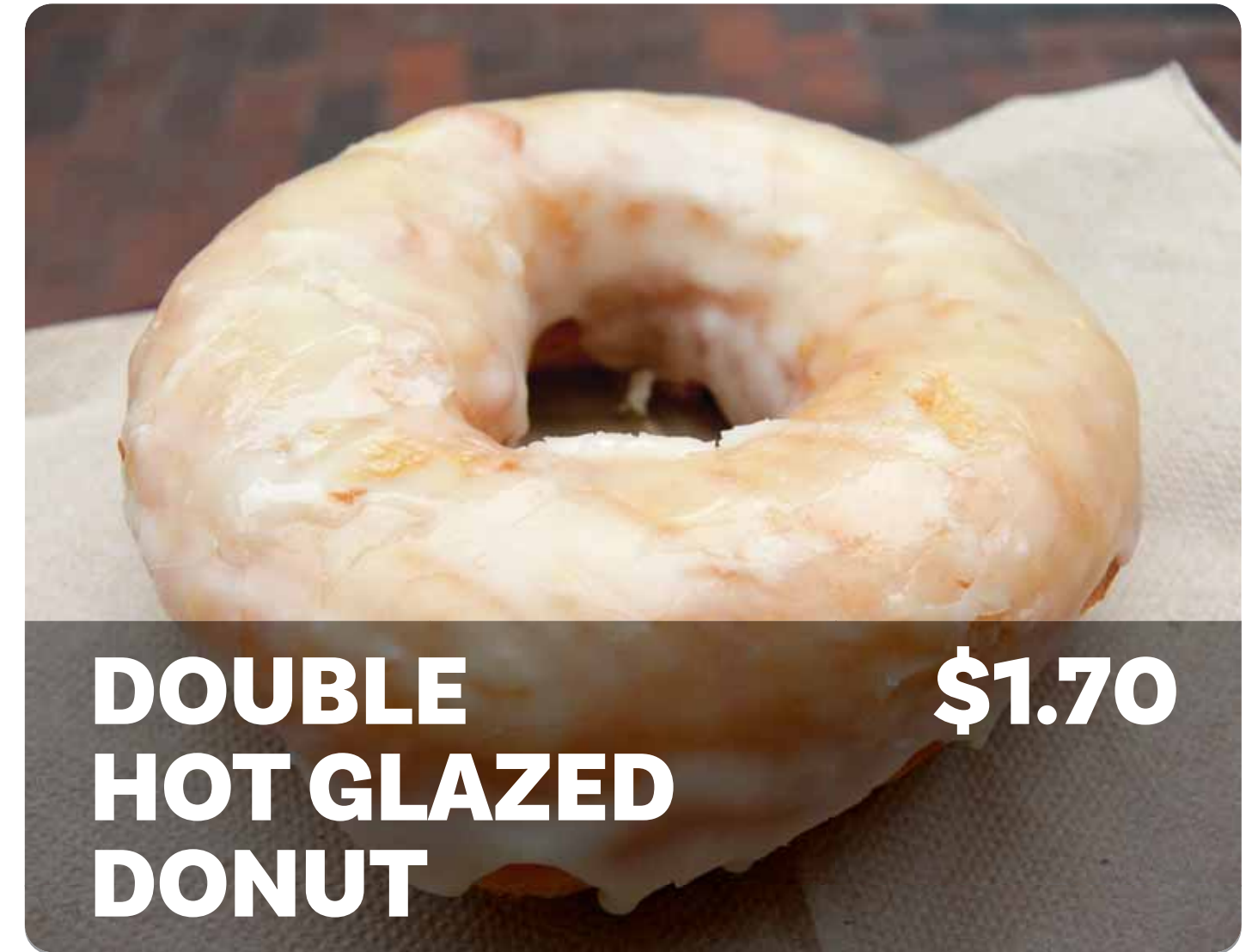
DOUBLE HOT GLAZED DONUT $1.70