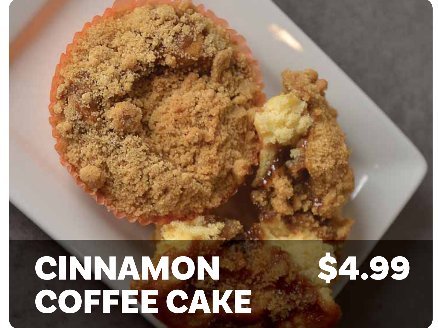
CINNAMON COFFEE CAKE $4.99