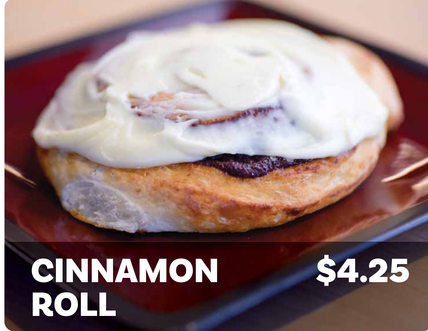
CINNAMON ROLL $4.25