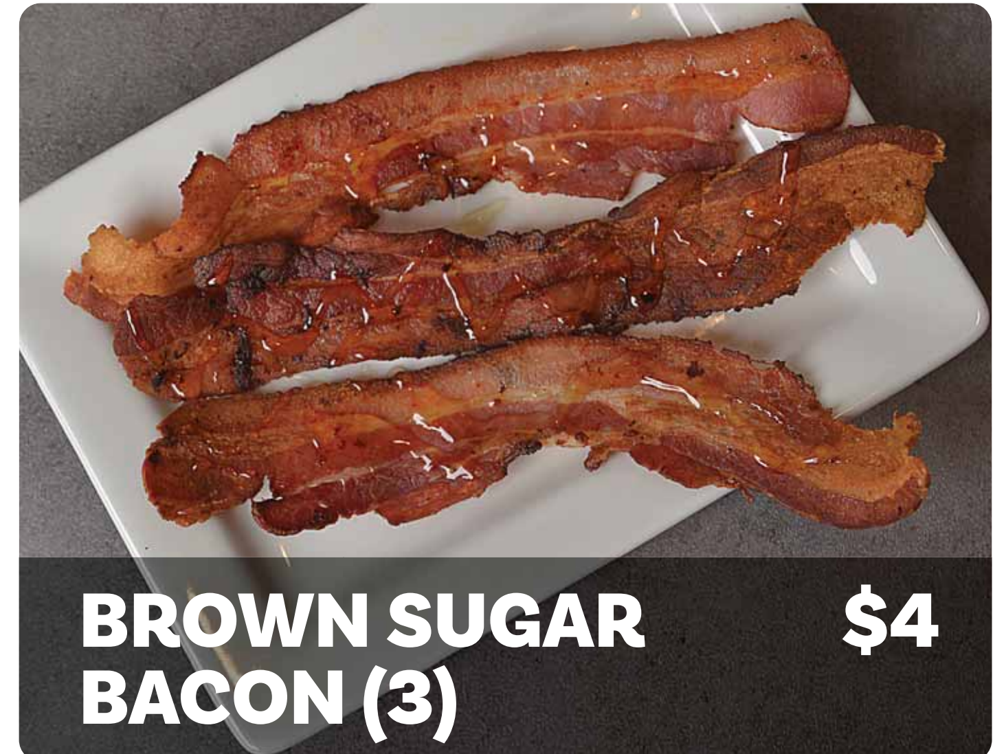
BROWN SUGAR BACON (3) $4