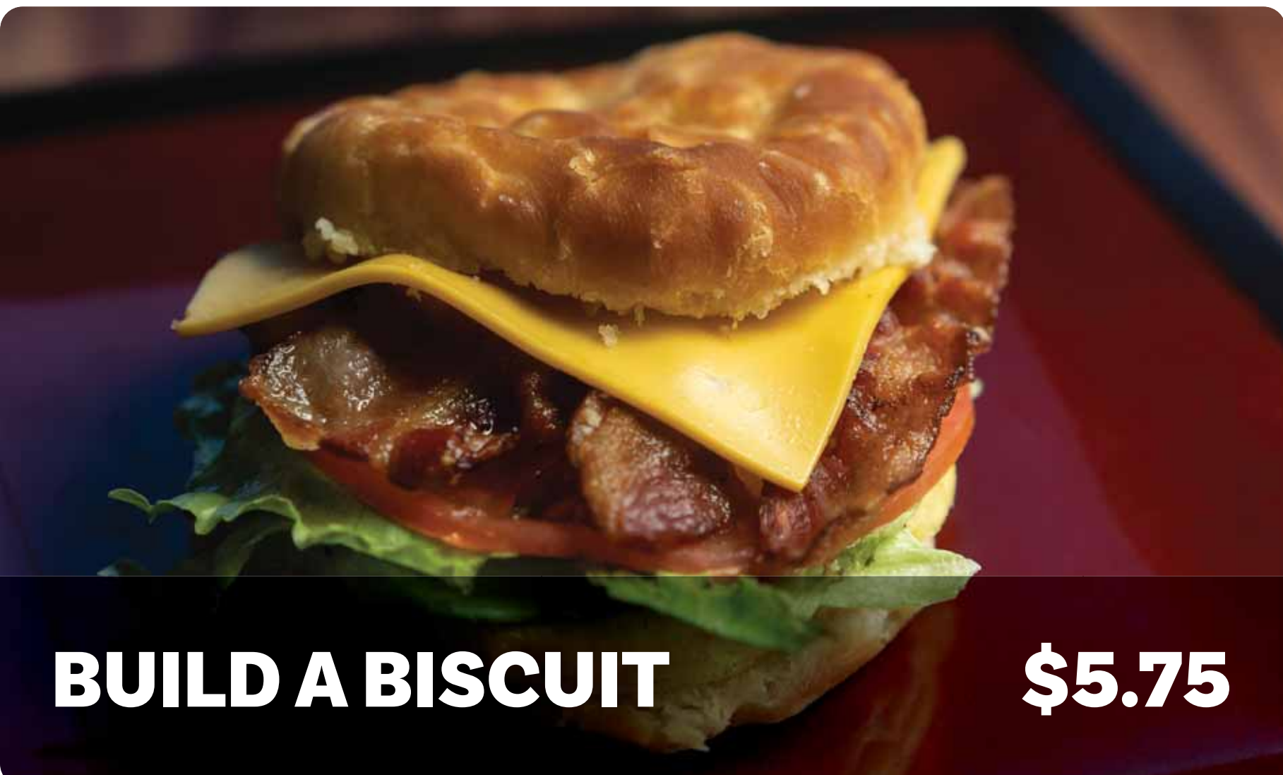
BUILD A BISCUIT $5.75

BREAD: BISCUIT, CROISSANT, WRAP, ENGLISH MUFFIN