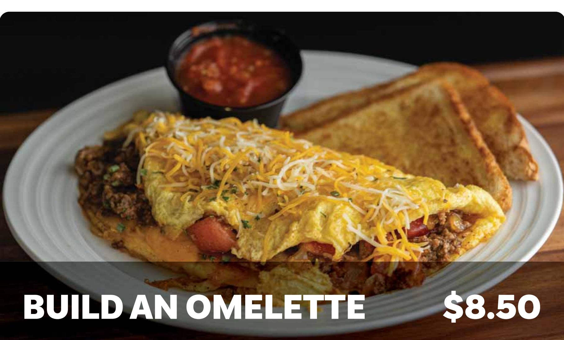
BUILD AN OMELETTE $8.50

Eggs and cheese, served with toast or biscuit