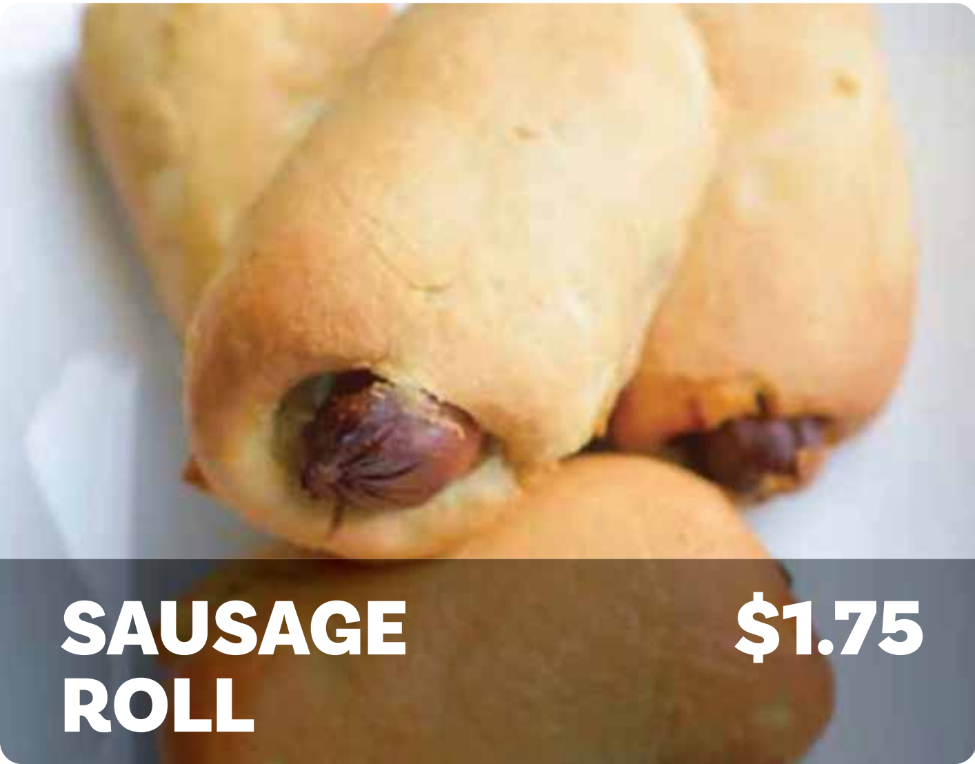
SAUSAGE ROLL $1.75