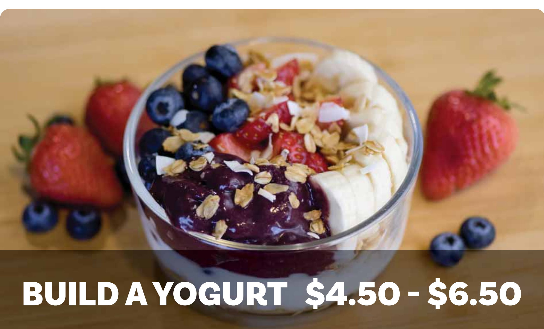
BUILD A YOGURT $4.50 - $6.50